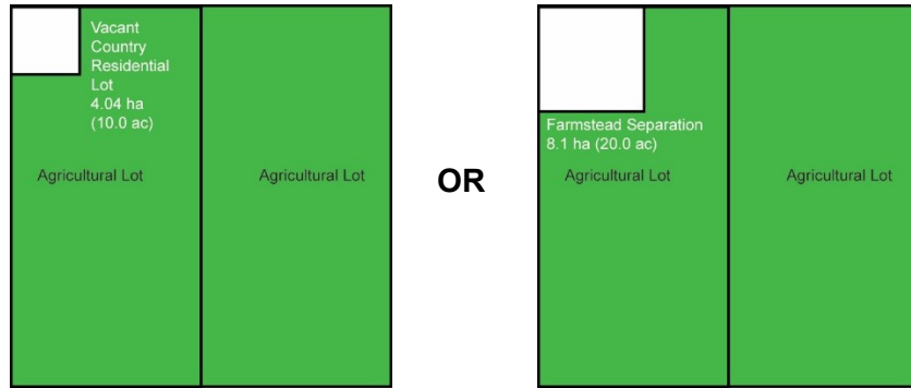
Figure 2. Maximum of Three Parcels per Quarter Section

6.4.4 Subdivided parcels for country residential purposes as described in Subsections 0 and 0 shall: